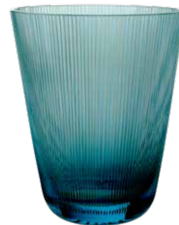
75-12 107 mm - aquamarine