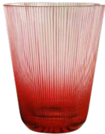
77-12 107 mm - ruby