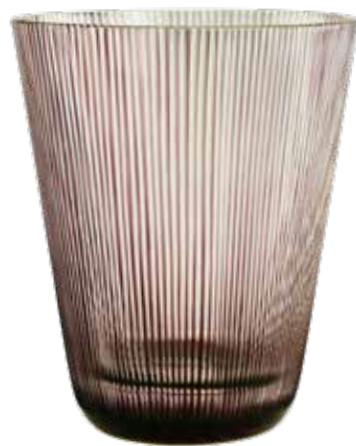
74-12 107 mm - amethyst