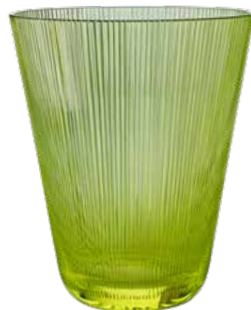
73-12 107 mm - reseda