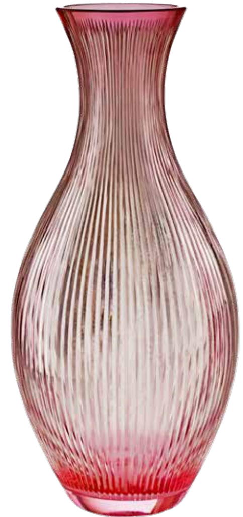
77-74 260 mm - ruby