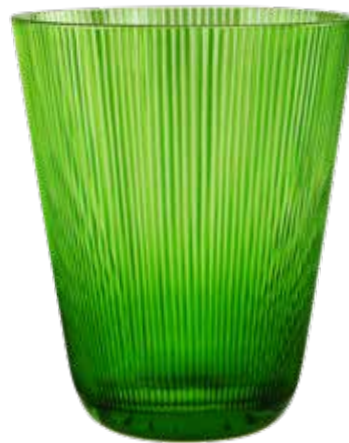
72-12 107 mm - emerald