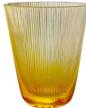
76-12 107 mm - tangerine